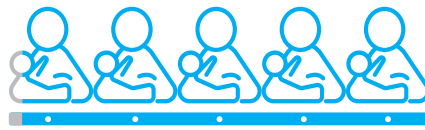
Figure 1 Share of babies that are breastfed in high-, low- and middle-income countries.

In low- and middle-income countries, almost all babies are breastfed